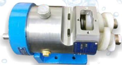
Ideal for Filling Machine